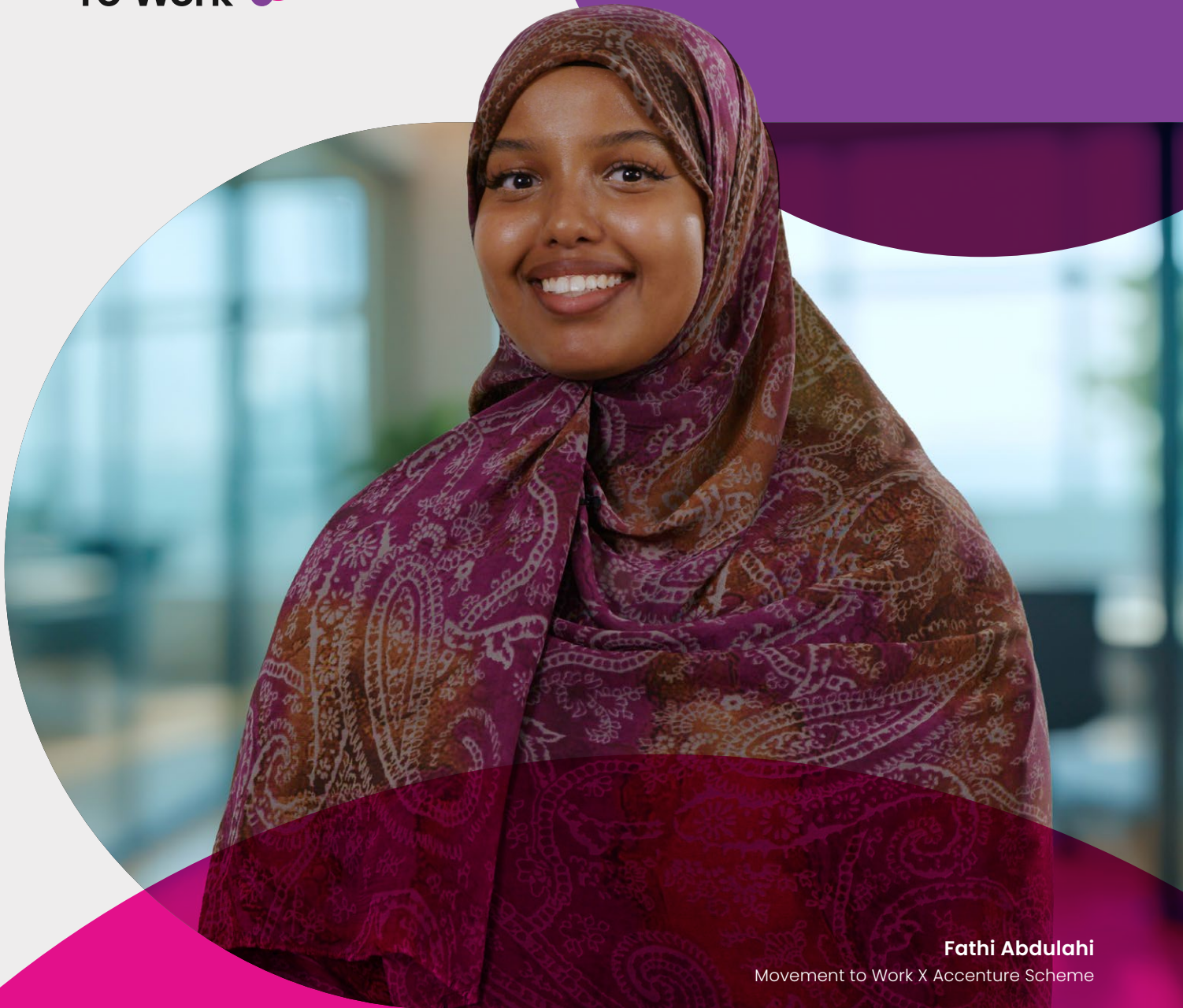
Fathi Abdulahi Movement to Work X Accenture Scheme